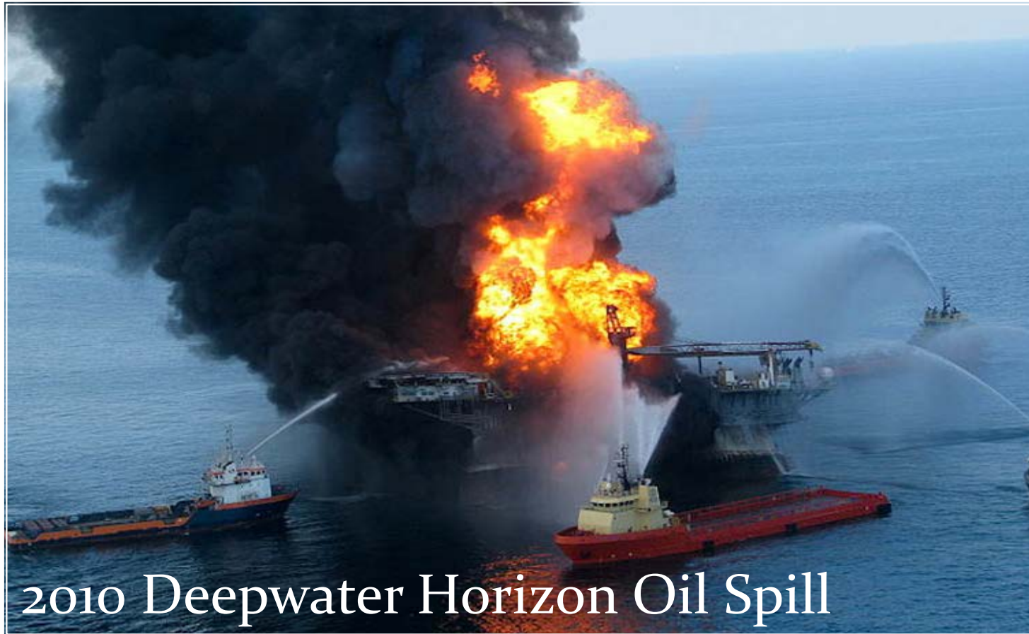
2010 Deepwater Horizon Oil Spill