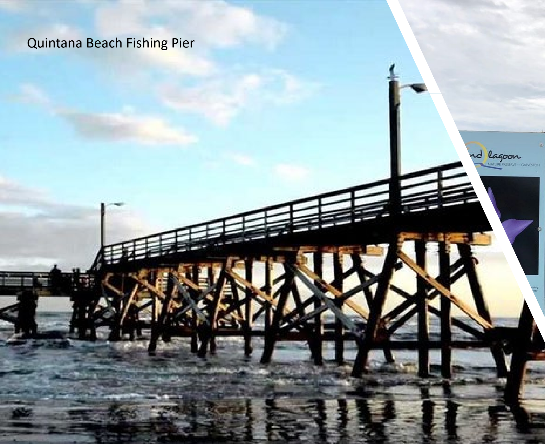
Quintana Beach Fishing Pier