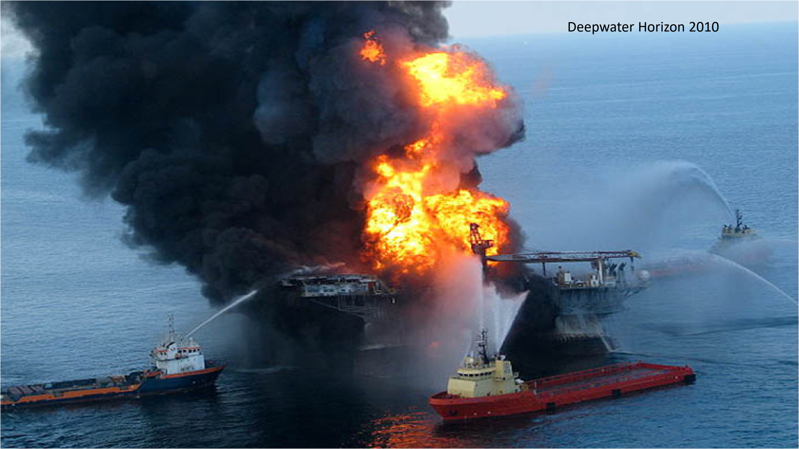
Deepwater Horizon 2010